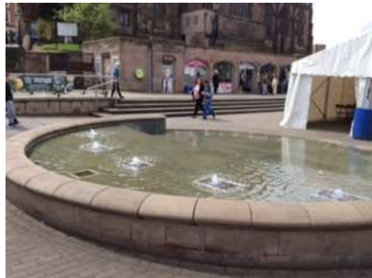
Water feature in Rotherham