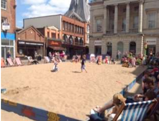
Beach in Lincoln last year

include a café and meeting place to create a more sustainable space and increase footfall and dwell time. This would bring more income into the museum and enable it to be open more frequently.